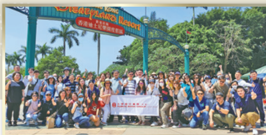
Staff participating in team building activities at Hong Kong Disneyland Park.