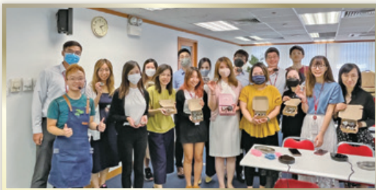
Staff displaying their handmade coffee ground soaps in a lunchtime workshop.