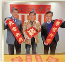
Senior Management and the calligrapher holding the Fai Chun, wishing everyone a prosperous year.