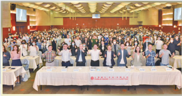
Group photo of the Bank staff at Business Forum 2023.