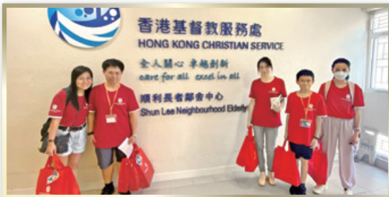
Staff volunteers and their family members distributing the care packages to the elderly and share the Mid-Autumn festive joy.