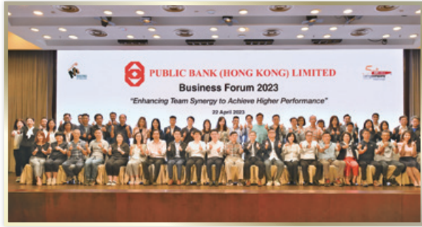
Group photo of Heads of Departments/Business Units and Branch Managers with Senior Management of the Bank at Business Forum 2023.