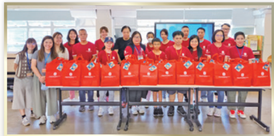
Staff volunteers collaborating with Hong Kong Christian Service in serving the elderly with love and action.