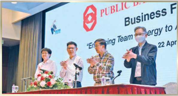
Senior Management of the Bank attended the Business Forum 2023.