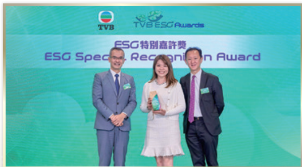
Representative from the PFHL Group receiving the ESG Special Recognition Award from Award presenters of Television Broadcasts Limited.