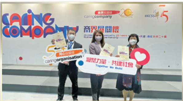
Representatives from Winton Financial Limited, the Bank and Public Finance receiving the "Caring Company" Logo awarded by The Hong Kong Council of Social Service.