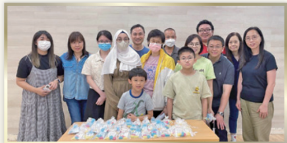
Staff volunteers and their family members making handmade gifts for donation to the Boys' and Girls' Club Association of Hong Kong.