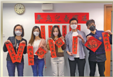
Staff holding the Fai Chun with blessings and good wishes written by a calligrapher to celebrate the Year of Rabbit.