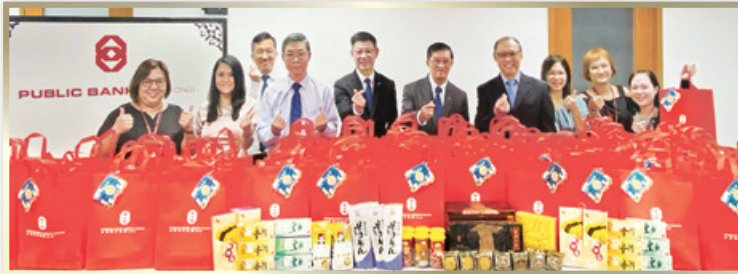
Staff volunteers packing 100 care packages for delivery to the elderly for celebration of Mid-Autumn Festival.