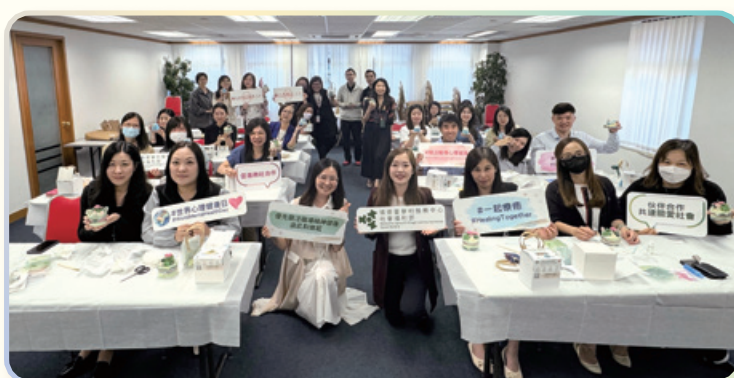
Facilitated by the workshop mentor from Epworth Village Methodist Church, staff creating their handmade aroma candles in a mental health awareness workshop.