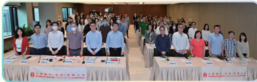
Group photo of the Bank's staff at Business Forum 2024.