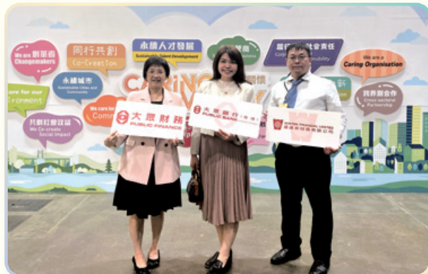
Representatives from Public Finance, the Bank and Winton Financial Limited receiving the “Caring Company” Logo awarded by The Hong Kong Council of Social Service.