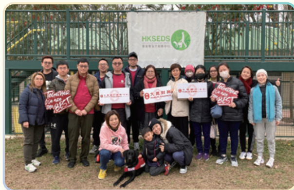
Staff and their family members visiting the Hong Kong Seeing Eye Dog Training School to understand the needs of people with visual impairments and how guide dogs assist them in their daily lives.