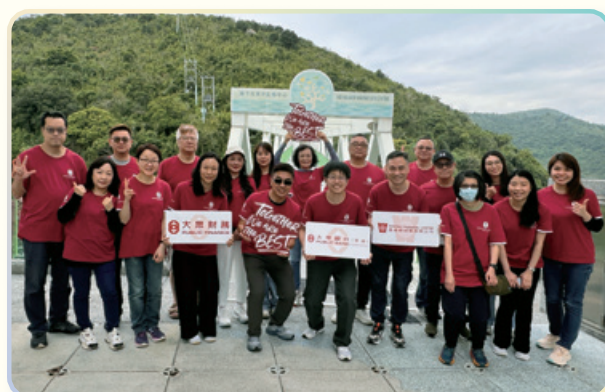
Staff participating in coral exploration tour at Hoi Ha Wan organised by the World Wildlife Fund-Hong Kong to understand the importance of marine life protection.