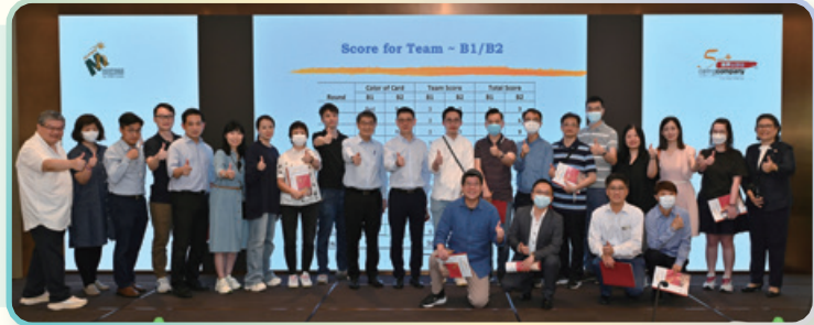
The champions of the workshop “Building a Winning Team” held during the Business Forum 2024.