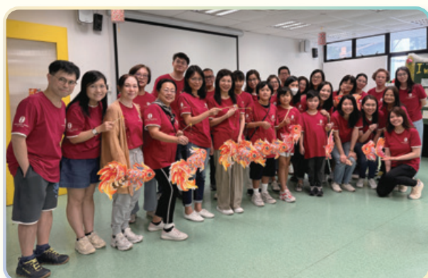
Collaborating with St. Barnabas Society and Home to organise a Mid-Autumn Festival activity "Lantern Making and Care Packages Distribution", staff volunteers and their family members show care to the elderly they served.