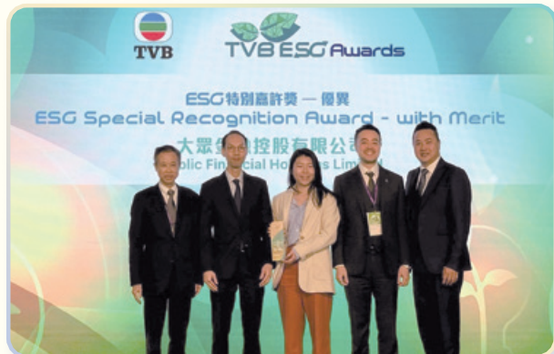
Representative from the PFHL Group receiving the ESG Special Recognition Award - with Merit from Award presenters of Television Broadcasts Limited.